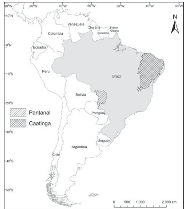
FIG. 1 Locations of the Pantanal and Caatinga biomes in Brazil.

To extract DNA from blood samples we followed standard phenol–chloroform extraction protocols (Sambrook et al., 1989). To extract DNA from faecal samples we used protocols based on the GuSCN/silica method (Boom et al., 1990; Höss & Pääbo, 1993; Frantz et al., 2003). We purified and concentrated the extracted DNA by ultrafiltration, using a Microcon-30 device (Millipore Corporation, Billerica, USA). To monitor for contamination each set of 16 faecal samples included an extraction control. All steps